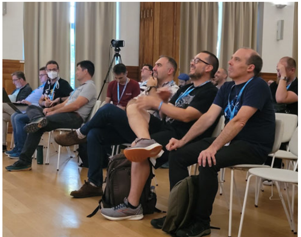
The conference takes place in a single room so the talks have the full audience and a very attentive one (based also on speakers impressions).