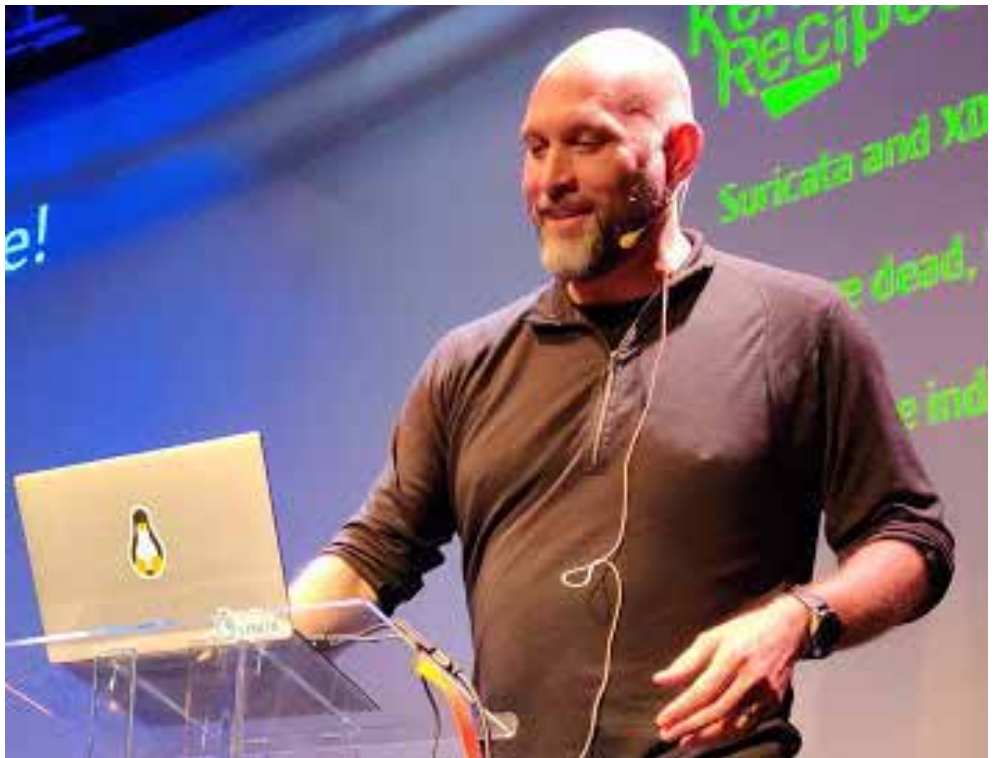
The conference takes place in a single room so the talks have the full audience and a very attentive one (based also on speakers impressions).